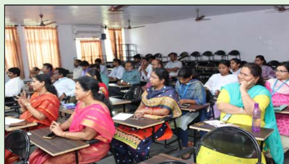
Faculty Attending the Workshop