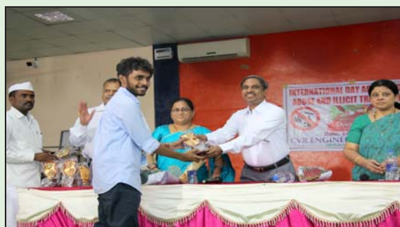
Presentation of Mementos