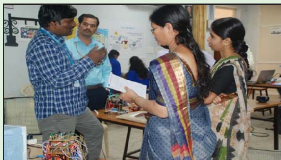
Participants in the FDP