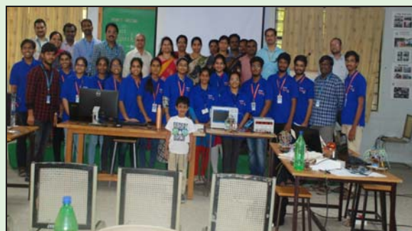
Faculty and Student Volunteers at the FDP