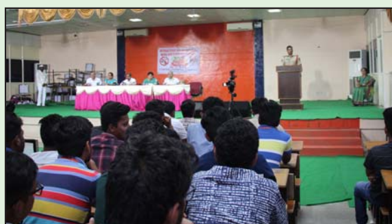
The Police Address the Students