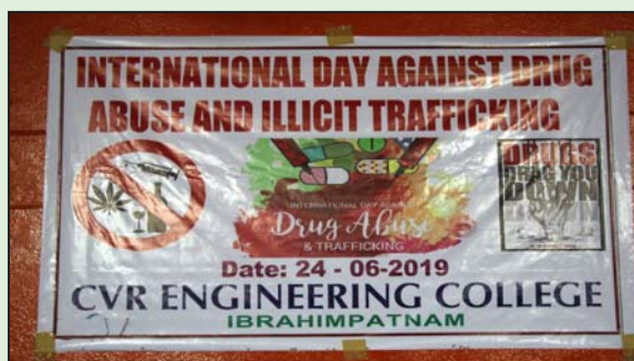
The Programme Begins

all the dignitaries on the dais spoke on the occasion. The speakers cited various cases of drunk driving, and drug abuse where youngsters are nipping their lives in the bud and also causing harm to the public. They addressed the