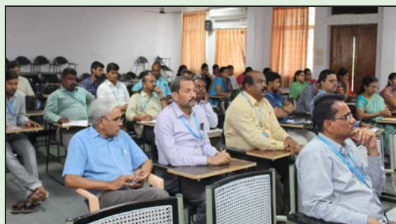
Faculty Attending the Workshop

The FDP was designed for 5 days in such a way, that the first 3 days focused on introducing participants to the concepts of Python programming and the following two days were spent on enlightening them about Data Analytics using libraries like NumPy, Scipy, Matplotlib , Panda etc.