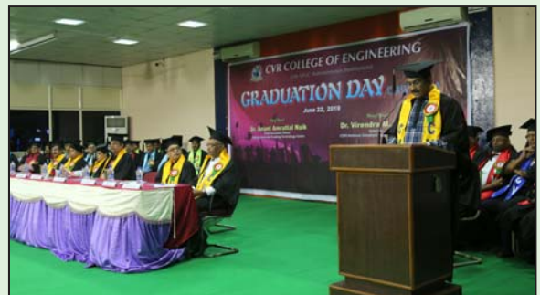
Chairman Addresses the Gathering