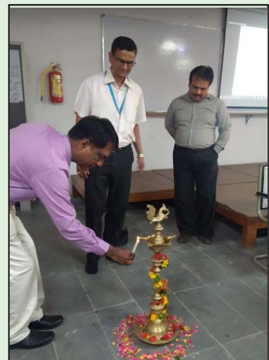
Inauguration of the FDP