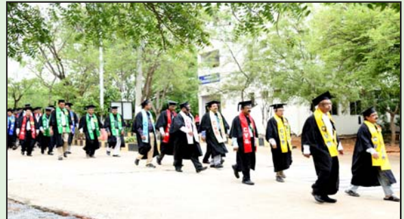
Academic Procession on its Way