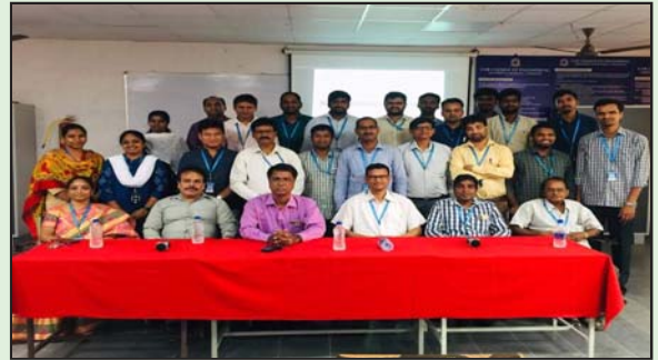
Participants at the FDP

congratulated every faculty member for participating in the event and making it successful. Later, some participants shared their learning experience and thanked the organizers for conducting the FDP.