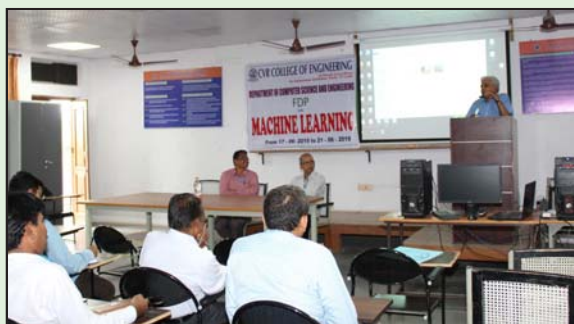
Guest Speaker Addressing the Participants at Machine Learning